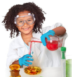
Mad Scientist May 16 - 20