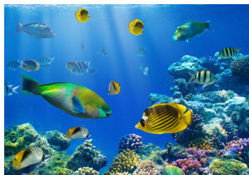
Ocean Life May 9 - 13