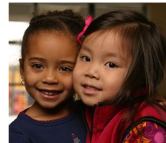
Farewell Friends May 2 - June 2